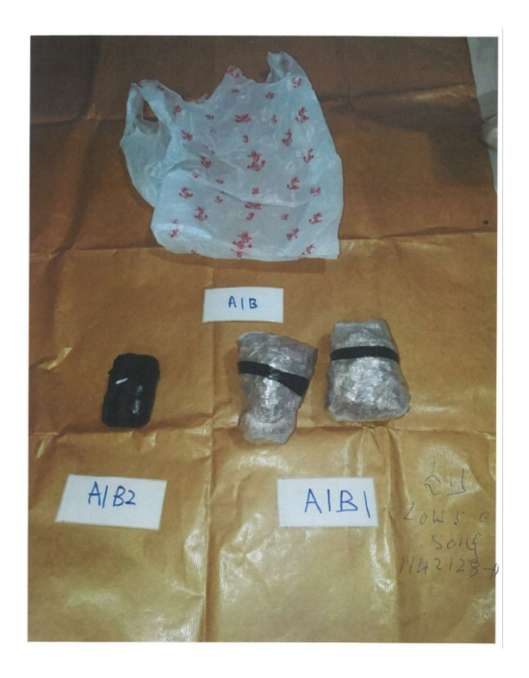
Fig 3. Photograph used in the course of recording Low's Contemporaneous Statement

56 Low relies on a photograph of the white plastic bag and its contents photographed at the Unit (the " Photograph ")<sup>72</sup> that depicts only three packets of drugs. For clarity, I reproduce a copy of the Photograph below: