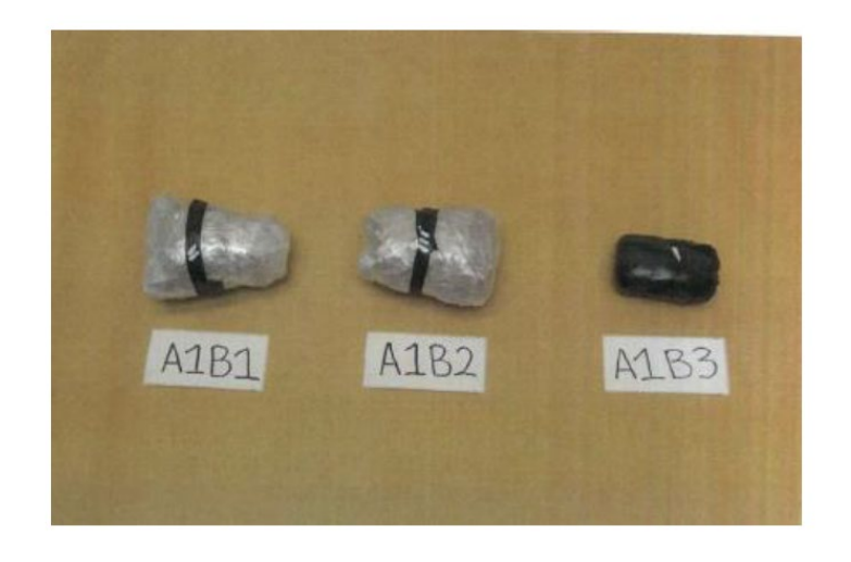
Fig 4. Photograph of exhibits 'A1B1', 'A1B2', 'A1B3'

122 From the state of the Drug Bundles as photographed during exhibit processing, I find Sivaprakash's account to be implausible. The Drug Bundles were wrapped so neatly and tightly that they had to be cut open during exhibit processing.<sup>230</sup>